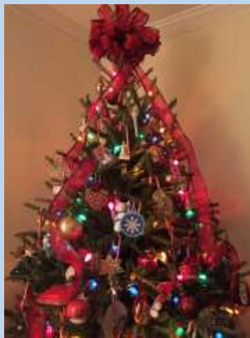
My Christmas tree! LOL