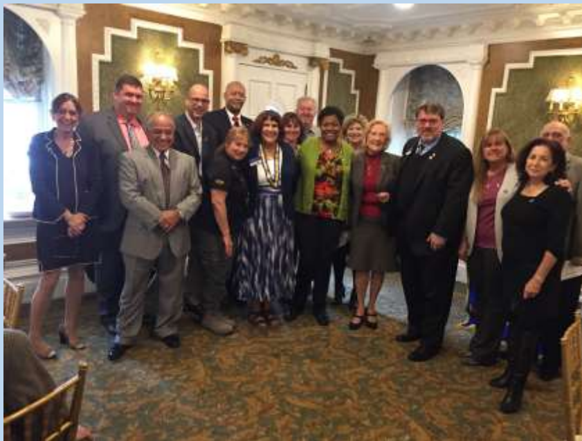
Perfect attendance awardees 2016-2017